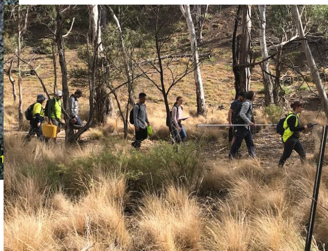
The gang checking boxes on Black Wattle Flat

We're checking a lot more boxes in one day than we used to, with 45 glider boxes now installed throughout the park! Our team of volunteers worked hard and enjoyed a few cuppa breaks throughout the day courtesy of Terry and FOOPs.