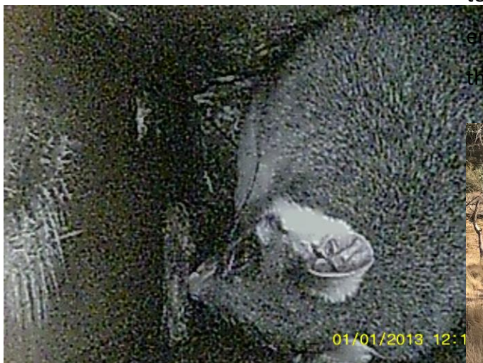
Ring-tailed possum in T1 – named for being near the Toilet block!

We also had some of our usual intruders enjoying the Sugar Glider boxes, including possums and even a rat.