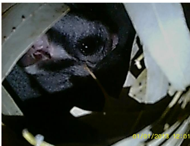
Beautiful big eye on the glider in RG5

We also had some of our usual intruders enjoying the Sugar Glider boxes, including possums and even a rat.