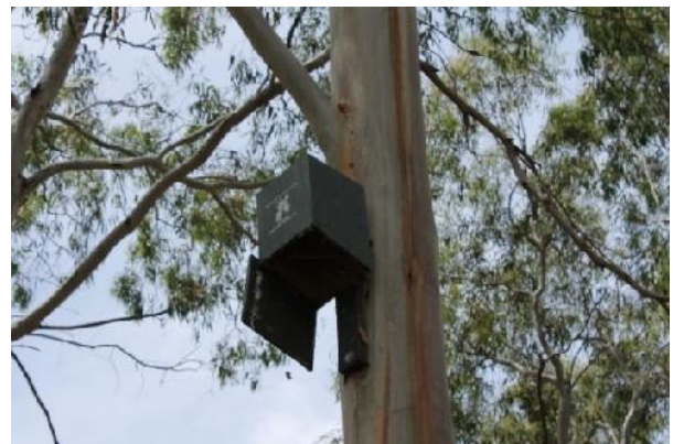
SG4- cleaned out and left upside down to get rid of the ants.

After not such a nice event, we continued checking boxes, MF4 was completely empty, SG4 was riddled with ants and was turned upside down and cleaned out. Ants have been a problem in this box for quite some time.