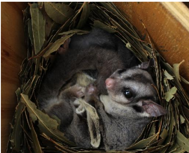
SG1 - A family including juveniles

The first sighting of gliders was in SG1. Last month this box was home to two juveniles, we were pleased to see them again this month. We also closed Bat Box C37.