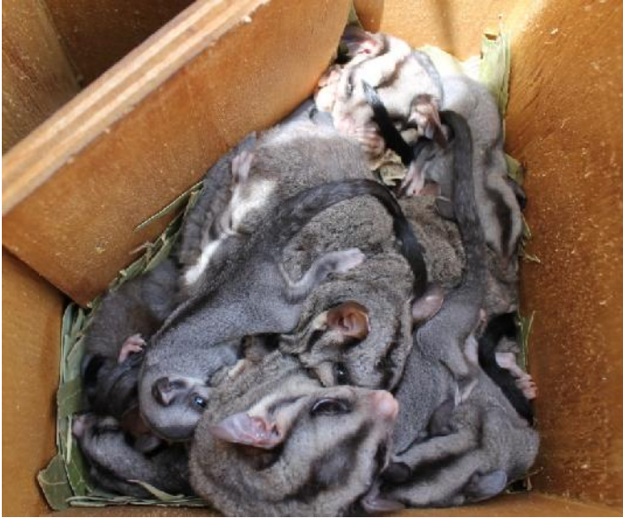
SG5- Can you count 14?

A final look in the box revealed that there were still 6 adults, same as last month. But an additional 8 juveniles were recorded. All juveniles in the box appeared to be at different stages of life. By far the most exciting sight was two tiny, furless sugar gliders with their eyes still closed.