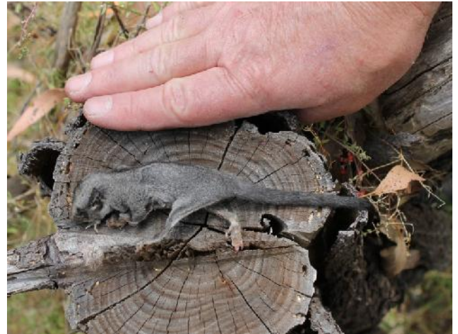
MF5 – A dead juvenile Sugar Glider

Once up there she said she could smell something quite potent and I knew straight away that there had to be a dead animal. On further inspection, we found a young dead (possibly a male) sugar glider in MF5.