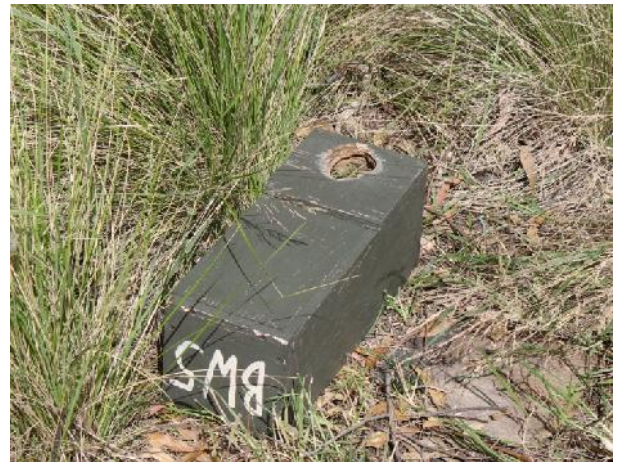
BW5 with no back panel, lying in the grass.

Next to be checked was BW5, lidless and usually home to a Brushtail possum. Unfortunately when we wandered over to it, it was laying on the ground having fallen off the tree.