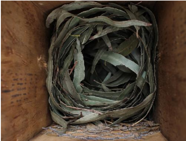
MF9 – No one home!

Back across the creek, we began checking the boxes along Main Flat. It was great to see that the majority of nesting boxes have nesting material in them.