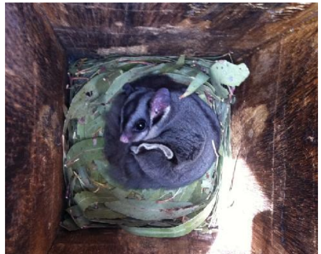
MF3- Male sugar glider

We then checked MF3, empty last month. However this month there was one lonely male in there. We now have a total of 20 sugar gliders for the day. Our new record!