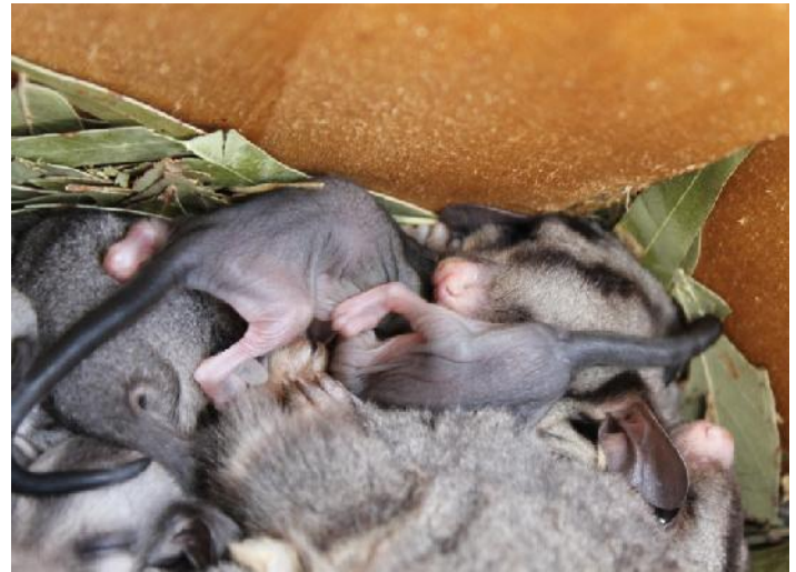
SG5 – Two tiny juveniles

As I did last month I will attach some pictures at the end of the report, as there are quite a few!