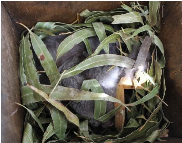
Box12 – a cosy family!

Next, box 12. There were four gliders inside, 3 adults and 1 juvenile. This is the first time we have recorded gliders inside this nesting box. We are very pleased to see them moving around and utilising boxes. However, once we came to box 11 which always has gliders inside, we found the lid on the ground. So we assume that the gliders that once called box 11 home have moved to the newer box 12.