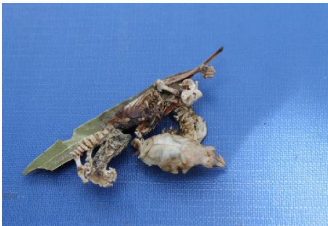
Skeleton in box 12

Unfortunately also in box 12 we found another young dead sugar glider. Just the skeleton was left.