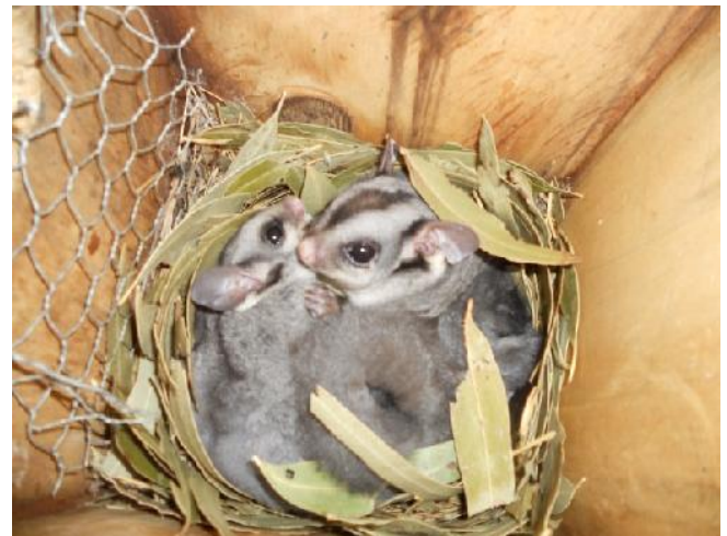
Box 3- the scent gland on the head of the right glider indicates that he is a male

We found Sugar gliders present in seven of the boxes on Main Flat and nesting material in seven others. Two males in SG6 had the cloudy eye which we have seen in Sugar gliders at Organ Pipes NP often in the past. One had a cloudy right eye, the other a cloudy left eye.