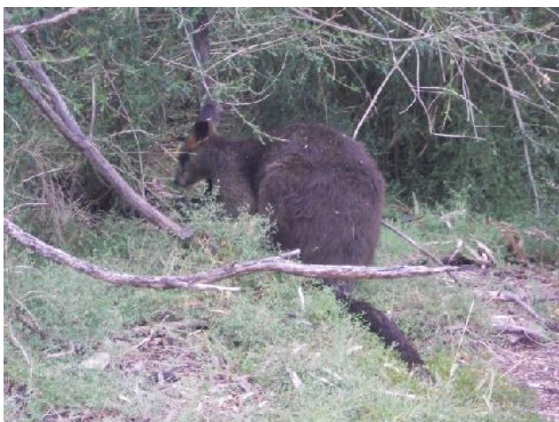
Swamp wallaby looking very relaxed and happy

When we finished checking Box 11, we turned around to see one of the resident Swamp wallabies munching on an acacia behind us. He/she was unconcerned by our presence, so we watched him/her for a bit and took some photos.