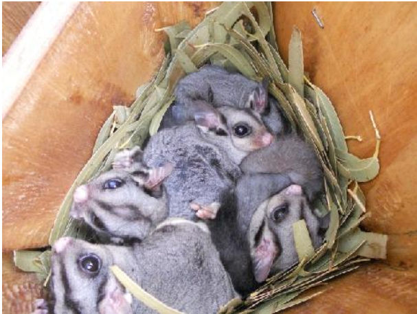
SG6- two males present with cloudy eyes

We stopped by the Organ Pipes to take a group photo, and nearby we spotted a very full nest of Dusky wood swallow chicks toughing out the wet weather. Their parents were perched nearby keeping a close eye on them.