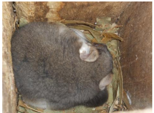
RG10- Ringtail possum