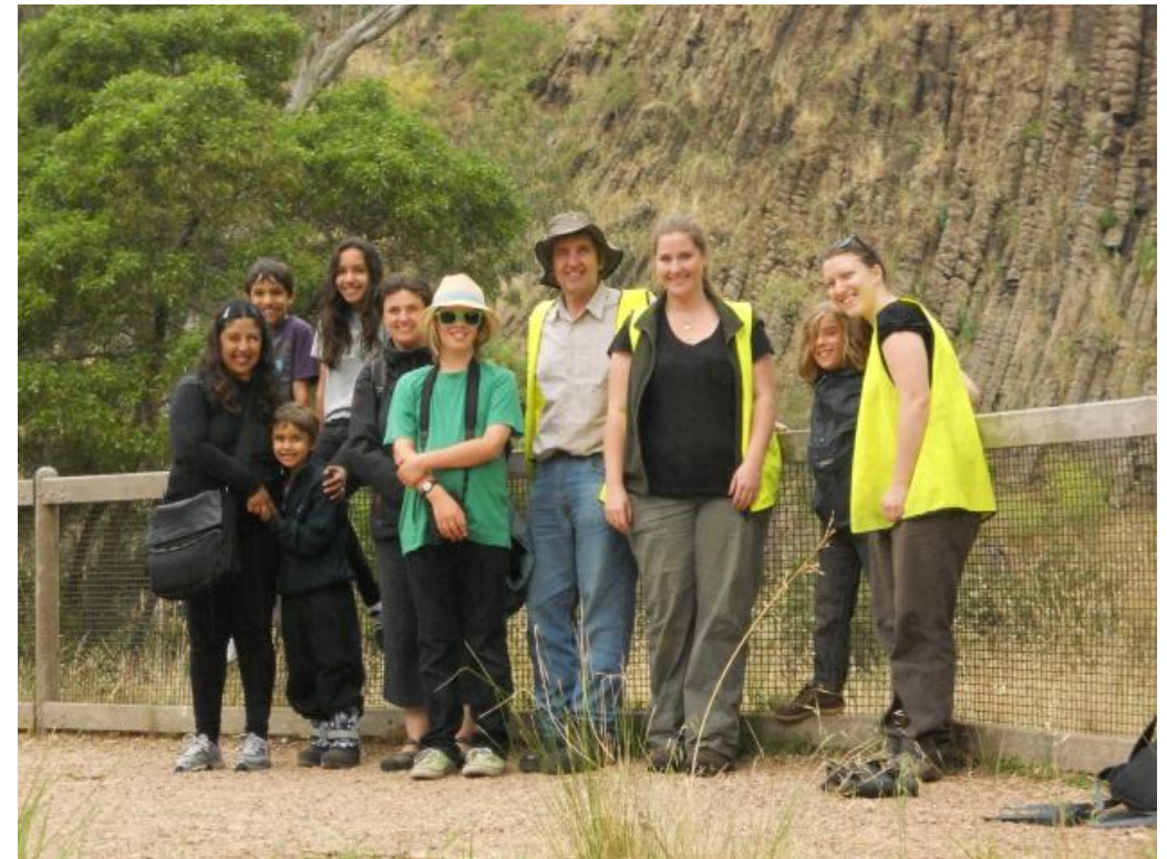
The group taking some time down by the Organ Pipes, enjoying the spectacular view.

Don't forget to like us on Facebook, you can even see some video footage of the gliders in their nest boxes!