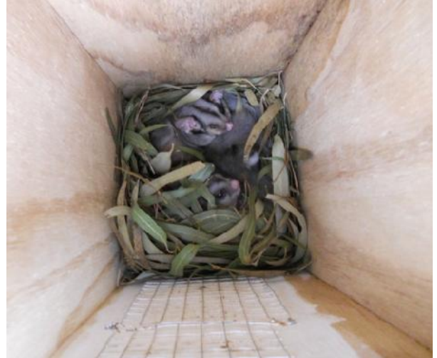
RG6- Four Sugar gliders, one with a missing right eye