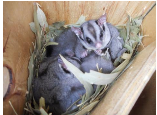
RG12- Three Sugar gliders including one male

As those of you who regularly read our reports may remember, quite a few of the Sugar gliders at Organ Pipes NP show signs of cloudy or missing eyes. We cannot know for sure if the cloudy and missing eyes are connected in any way, as the missing eyes may have been lost in glider disputes. However, we have considered the possibility that the cloudy eyes could be an infection or genetic disease which leads to loss of the eye. While looking at the gliders in RG12, we noticed that one of the gliders was showing symptoms that we have not observed before. His left eye was swollen and weepy, but not yet cloudy. We wonder if this could be the beginning stages of the other eye problems. We are hoping to find out what is causing these symptoms soon if we can.