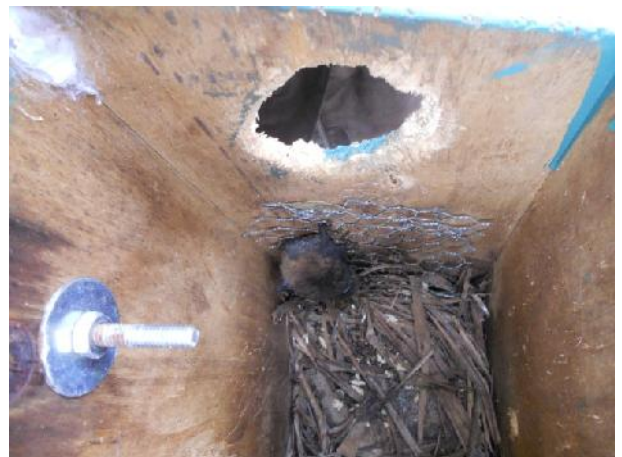
Box 11- a bat taking shelter in an old Ringtail possum nest