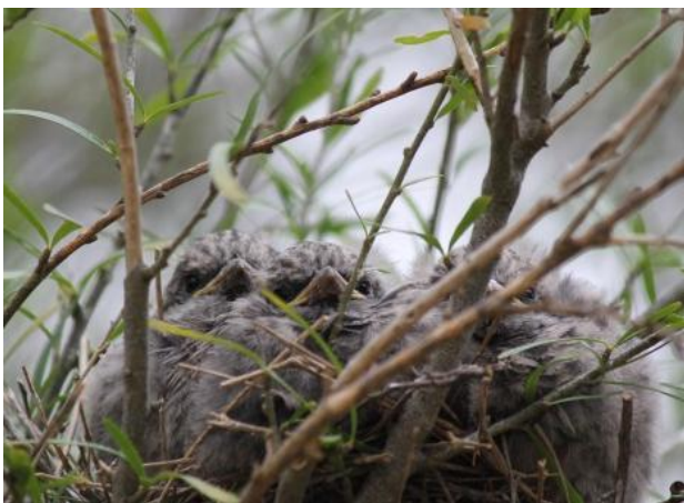
Three Dusky wood swallow chicks in their nest

We stopped by the Organ Pipes to take a group photo, and nearby we spotted a very full nest of Dusky wood swallow chicks toughing out the wet weather. Their parents were perched nearby keeping a close eye on them.