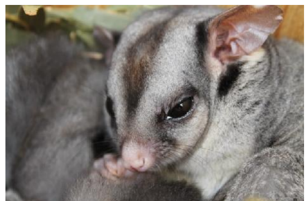
RG12- Closer view of the male with a swollen and weepy eye