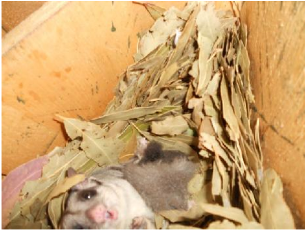
SG1- this male made it clear that he was not happy to be woken up!