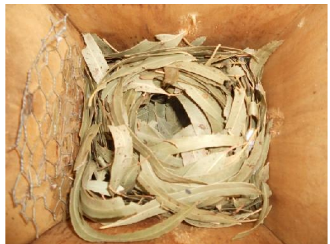
Sugar glider nesting material