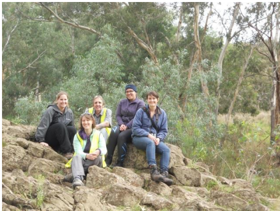
Group photo at Tessellated Pavement