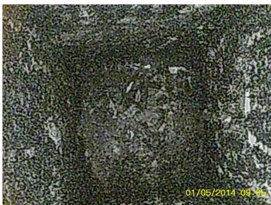
Ant colony in Box 7