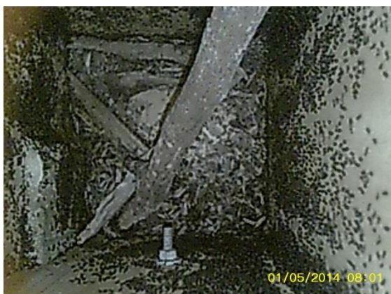
Box propped open with a stick