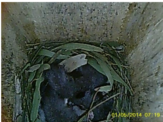
Three gliders in MF6

Unfortunately four of our boxes had ants using them. The number of ants ranged from a scattering colonising a box to a full blown nest which coated the entire inside of the box. We propped them open using a stick to create harsher environmental conditions inside the box and make it a less comfortable place for the ants to live. This usually works to discourage them, although we have had cases of ants returning after a while if gliders don't start using the box.