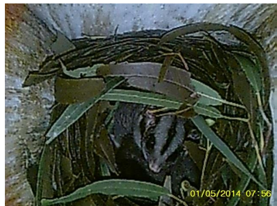
Glider looking at the camera in MF4

Unfortunately four of our boxes had ants using them. The number of ants ranged from a scattering colonising a box to a full blown nest which coated the entire inside of the box. We propped them open using a stick to create harsher environmental conditions inside the box and make it a less comfortable place for the ants to live. This usually works to discourage them, although we have had cases of ants returning after a while if gliders don't start using the box.