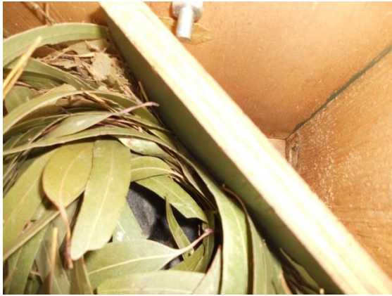
At least 2 Sugar gliders in RG11