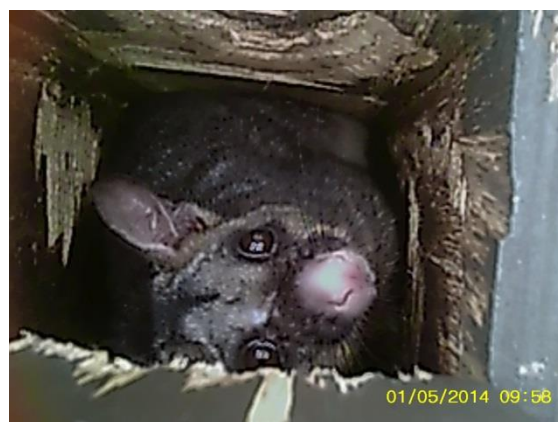
Brush-tailed possum in RG9