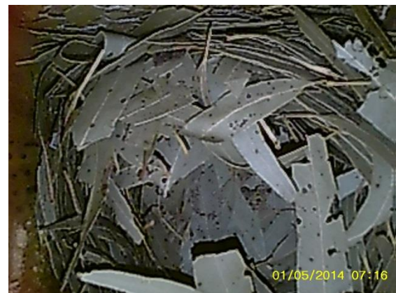
Sugar glider nest material in Box 2

We started off on Main Flat and worked our way through the nest boxes starting at Box 2. In Box 2 we found nest material. Even though there weren't any gliders inside, it is good to know that the box is being used. We found nest material in eleven of our boxes this check.