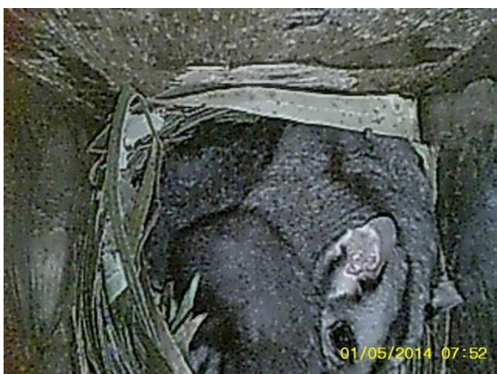
At least two gliders in MF5