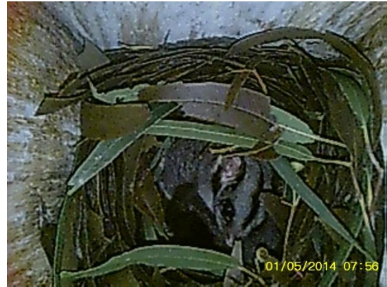
Two gliders in MF4

In MF6 we found three beautiful gliders snuggled up. We are getting to the time of year when the gliders are starting to make their nests more closed over to keep them warm. This makes it harder to count them in some of the later months, but this time we were still able to make reasonable estimates. On Main Flat we also found Sugar gliders in Box 6, MF5 and MF4.