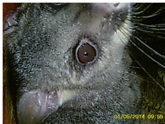
Brush-tailed possum in RG8