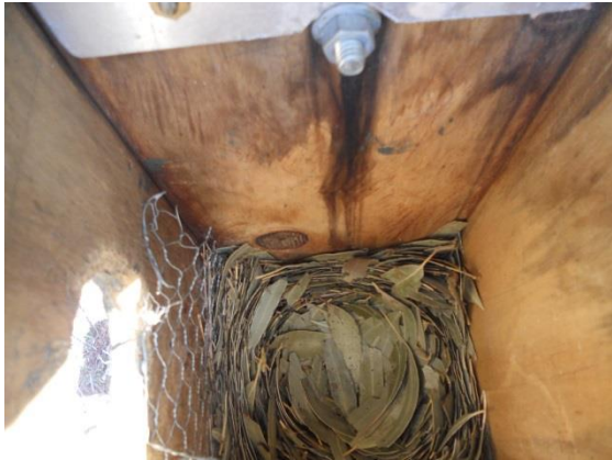
Sugar glider nest material in Box 3

In MF6 we found three beautiful gliders snuggled up. We are getting to the time of year when the gliders are starting to make their nests more closed over to keep them warm. This makes it harder to count them in some of the later months, but this time we were still able to make reasonable estimates. On Main Flat we also found Sugar gliders in Box 6, MF5 and MF4.