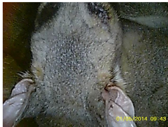
Brush-tailed possum in RG7

can do quite a bit of damage to the boxes after a while. We are going to put up some boxes specifically designed for Brush-tailed possums next month. We hope that they will prefer them and move out of the Sugar glider boxes (which are really too small for them anyway).