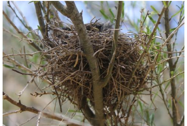
A Dusky wood swallow nest with 2 chicks poking out of the top.

A packet of biscuits and a couple of cuppa's later we jumped back into the ute and moved along to Red Gum Flat. But as we were getting into the vehicle we noticed that the dusky wood swallow nest that we saw last year, once again had chicks in it!