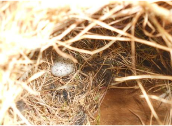
Box 12 - A bird nest and egg

Inside there was a nest, but it was a birds nest. Asha was able to look inside and see that there was a little egg inside. We often find a number of different mammal species in our boxes but have never had a bird!