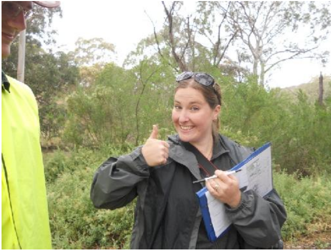
It's super exciting when we find gliders in our boxes!!

Back across the creek, we finished off the remaining boxes along the right side of the track on Main Flat. MF1, SG6 and box 7 were all empty; however both MF3 and MF9 had 1 glider in each.