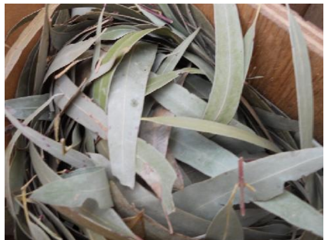
RG5 full of fresh nest material

The first box checked along Red Gum Flat is always RG5, it took a number of months but we are finally starting to see glider activity within this box. No gliders this month, but a lovely nest.