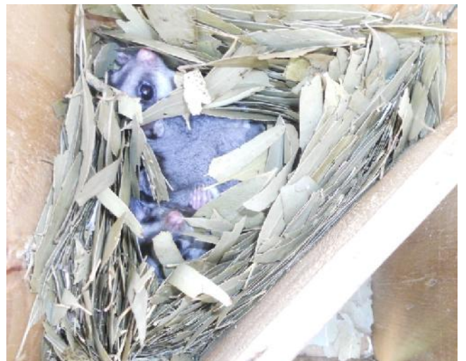
RG12- An adult and young

Arriving at our last box, RG12; Bernice received the honour of checking inside. She was delighted to see two little faces looking up at her. An adult and its young were in the box.