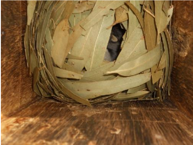
MF3 - 1 glider, possibly more

Back across the creek, we finished off the remaining boxes along the right side of the track on Main Flat. MF1, SG6 and box 7 were all empty; however both MF3 and MF9 had 1 glider in each.