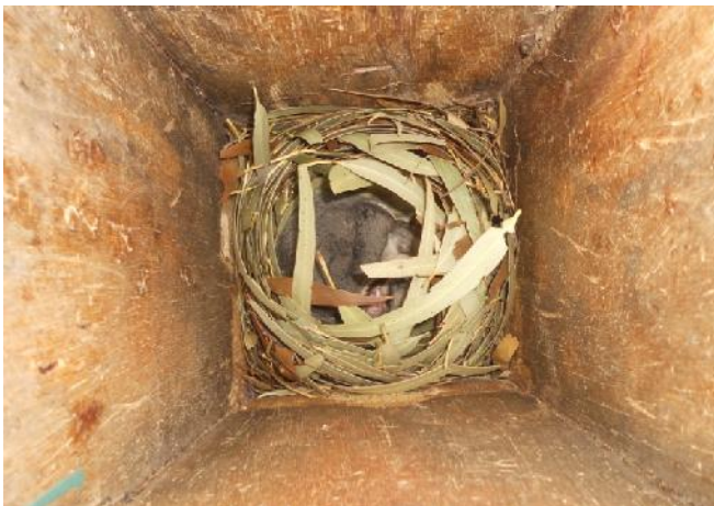
MF9- 1 glider all curled up

Box 4 has always had bees in it since we began officially monitoring boxes 3 years ago, but on a recent Bat box inspection Robert Bender discovered that the bees had since moved out. Now we are able to remove the box, clean out the honeycomb and relocate the new box to another area of the park.