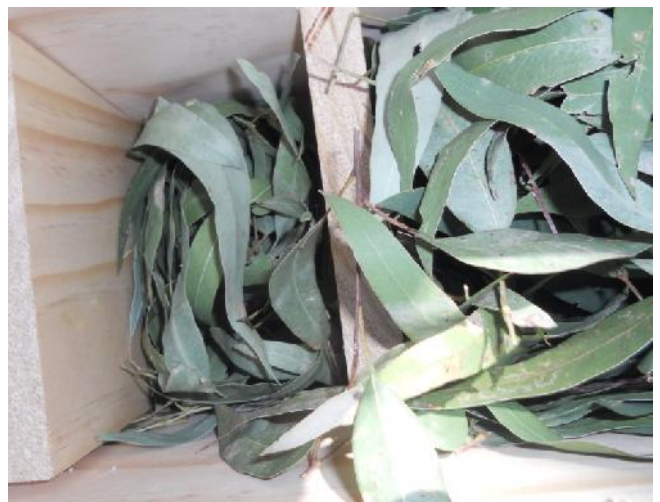
BW13- a fresh pile of eucalyptus leaves ready for some gliders!

Our last newly designed box BW13 and our last box on Black Wattle Flat gave us a great surprise.... it was full of fresh nest material. This is great news knowing that the gliders are investigating this box. Hopefully we will eventually start to see them in this box as well as in BW9 and BW11. We took a slow walk back to the creek, crossed back over and began checking the last 5 boxes for the day.