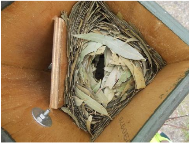
SG5 – A great picture of a perfect sugar glider nest