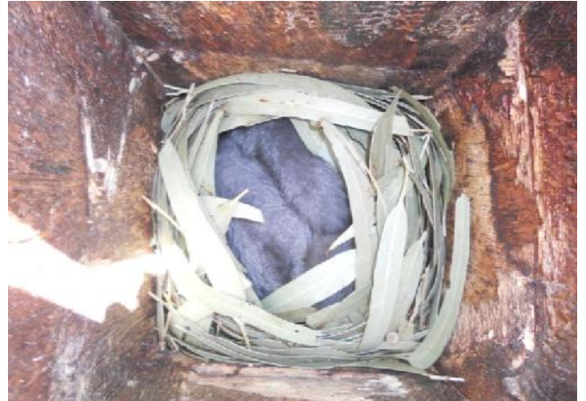
2 gliders in the new RG10

Inside RG10 there were 2 gliders. This is the first time we have had gliders inside this box since we removed it a few months back in May, repaired it and placed it back up. RG10 is the box right next to Rosette Rock, it used to be on the tree only about 1m off the ground. Since it has been repaired and placed higher on the tree we have seen so much activity and now actually have gliders inside!