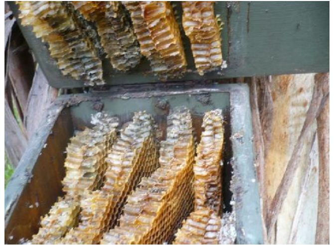
Box 4 full of honeycomb

Box 4 has always had bees in it since we began officially monitoring boxes 3 years ago, but on a recent Bat box inspection Robert Bender discovered that the bees had since moved out. Now we are able to remove the box, clean out the honeycomb and relocate the new box to another area of the park.