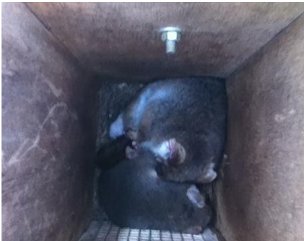
2 Ringtail possums in RG7

RG7, usually home to a brushtail possum had 2 Ringtail possums inside this month. Asha and Terry were delighted to see that finally the Brushtail possum in RG8 had moved across the path into a one of our specially designed Possum boxes.