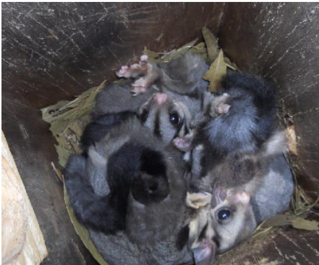
Box 8 - A family of gliders with at least one young

Since placing up box 8 across the creek it has always had gliders in it and this month was no different. There were 5 gliders, including 1 juvenile.