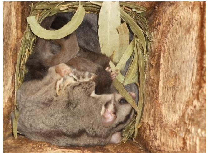
Box10 – a happy family of 4

We removed the stick from box 10 as the ants have now moved on. BW11 another of our new boxes was also empty. The next box, BW12 was home to 4 gliders. This box has proved to be quite optimal; it has had gliders in it consistently since being placed up.