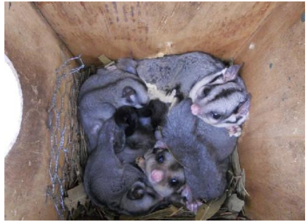
Box 2 – a family of gliders

When we checked the boxes in September, only 3 boxes on Main Flat had gliders in them. Luckily this month we saw a few more, there were 5 boxes with a total of 14 gliders.