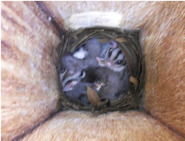
MF4 – A happy family of gliders in this box

We came to our last box along the left side of the track along Main Flat, MF1. This is a new box that we placed up about 4 months ago; it was propped open with a stick last month as it was full of ants. This month as we approached the box to remove the stick, we saw a tiny pink nose poking out at the top! A brushtail possum has taken advantage of the open box and has made a home.