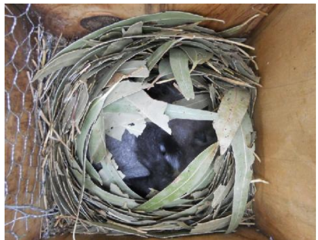
Box 3 – Two or more gliders inside

In box 3, there could possibly be more than 2 gliders, but we were unable to see 100%.