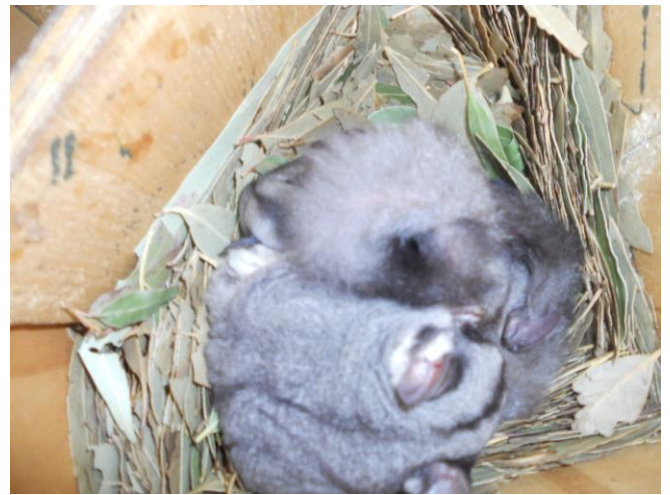
Two adults and one juvenile in SG1

If you look closely at the picture below, you should be able to see the rump of a juvenile glider in the top left corner.