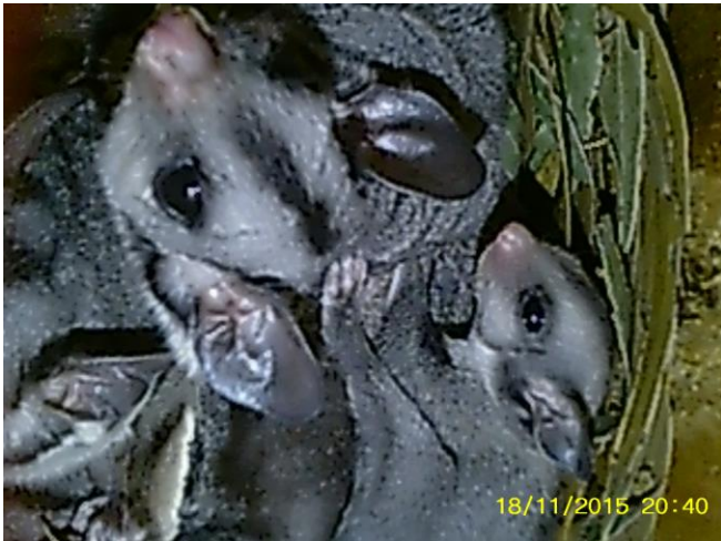
Two adults and two juveniles in Box 2

of juvenile gliders in the park- other years we have seen as many as fourteen in one box!