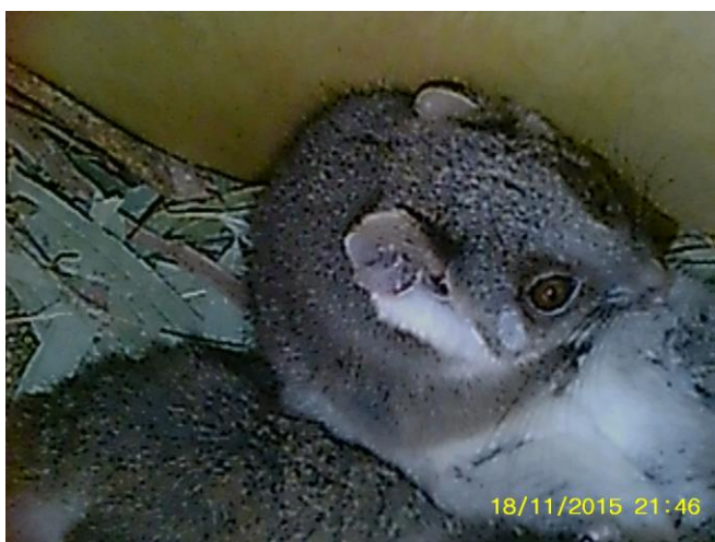
Juvenile Ring-tailed Possum in P2 with its mother

Our total Sugar Glider count for the day was 26 individuals- one less than last year. It was a great day, although a fair bit hotter than our checks usually are! We had a few coffee breaks to ease the day along and had a nice chat with the local Green Army team. Many thanks to Robert and Rowan for all their help, many hands make light work!