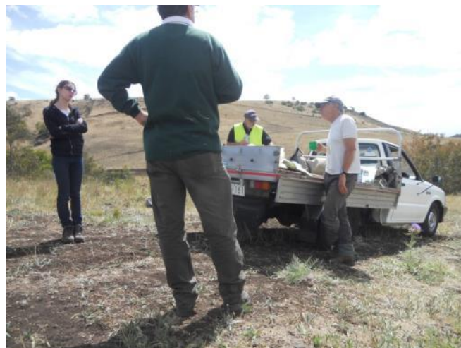
Time for a cuppa.

Time consuming to set up but these frames will last forever, and when the tree is a couple of metres high we can simply slide it over the top to place on another plant.