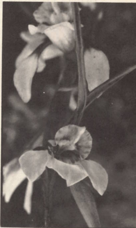
White diuris, Diuris punctata var. albo-violacea, now almost extinct.