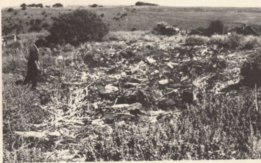
Horehound, boxthorn and rubbish—the car park area in 1972.