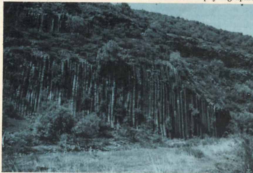
The Organ Pipes.